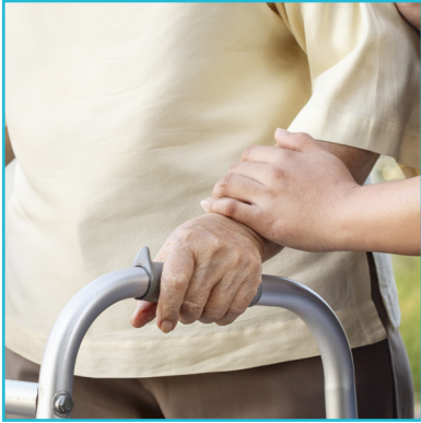
CONTINUITY OF CARE